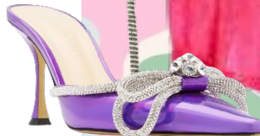
Mach & Mach Double-Bow Crystal-Embellished Leather Mules $1,050