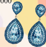
Sarah Ho 18k Yellow Gold Bright Young Things - The Laguna Earrings