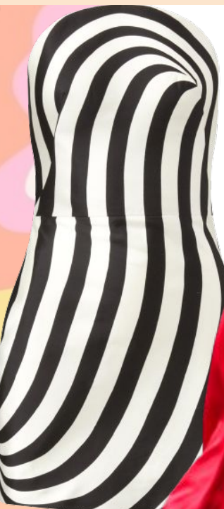
Brandon Maxwell Printed Silk-Wool Strapless Mini Dress $1,995