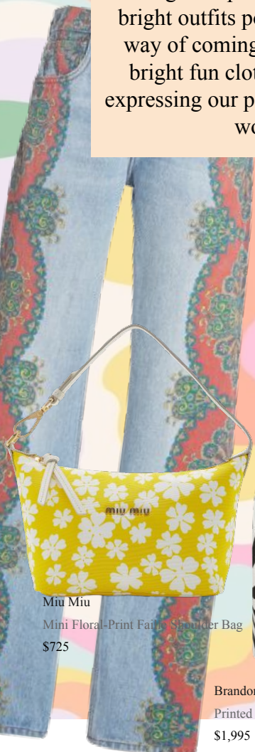
Miu Miu Mini Floral-Print Fanny Shoulder Bag $725