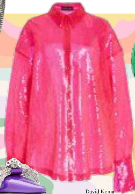
David Koma Oversized Sequined Shirt $2,000