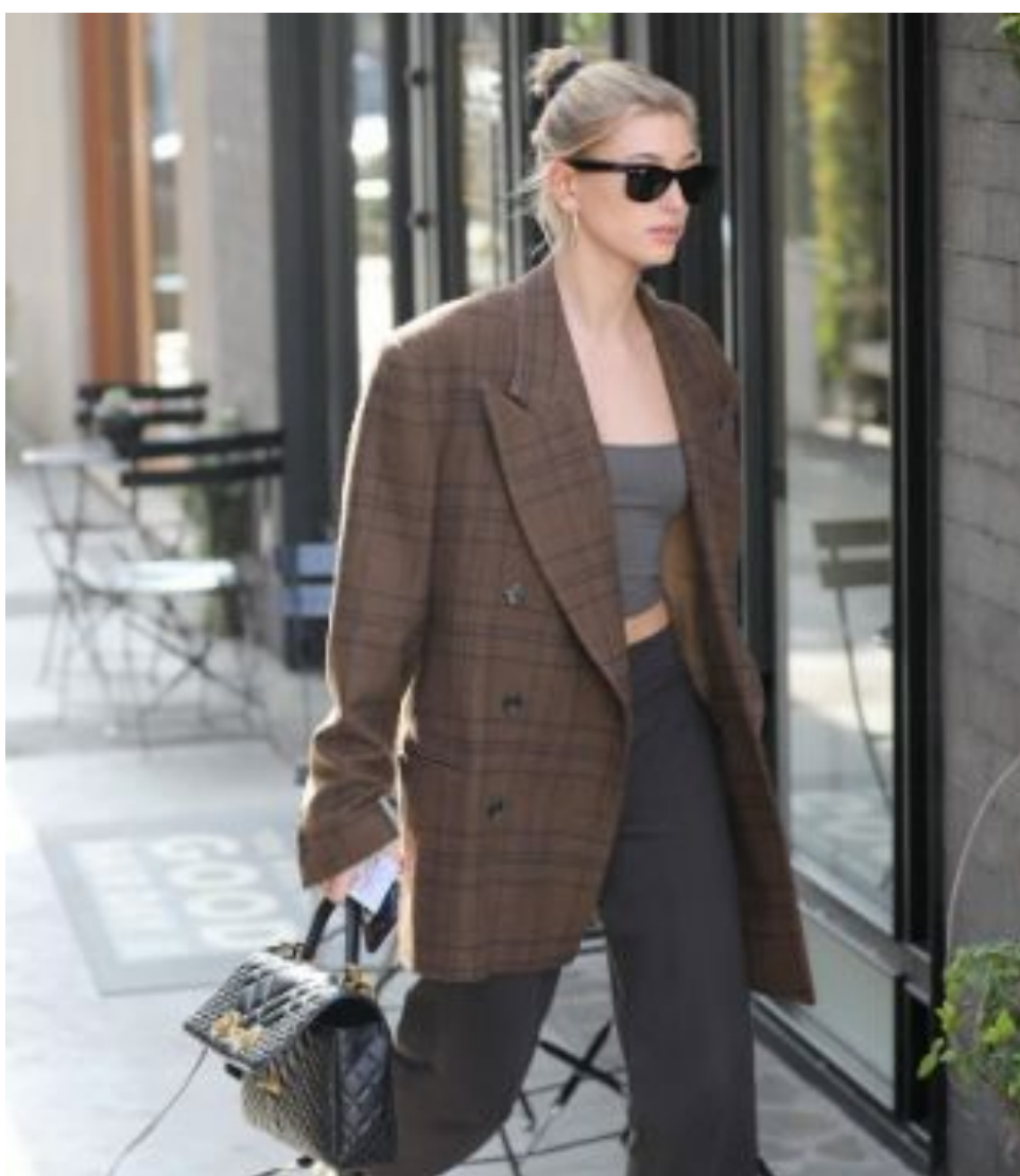
Bieber on the streets

Picture this: You're running out the door because you're late to your 9-5 or quite honestly anything, you only have on a white tee, but don't stress. Your boyfriend's blazer is sitting on the chair waiting to save the day. Lucky for you menswear has been all the rage in the most versatile way... and oversized is the fit of choice.