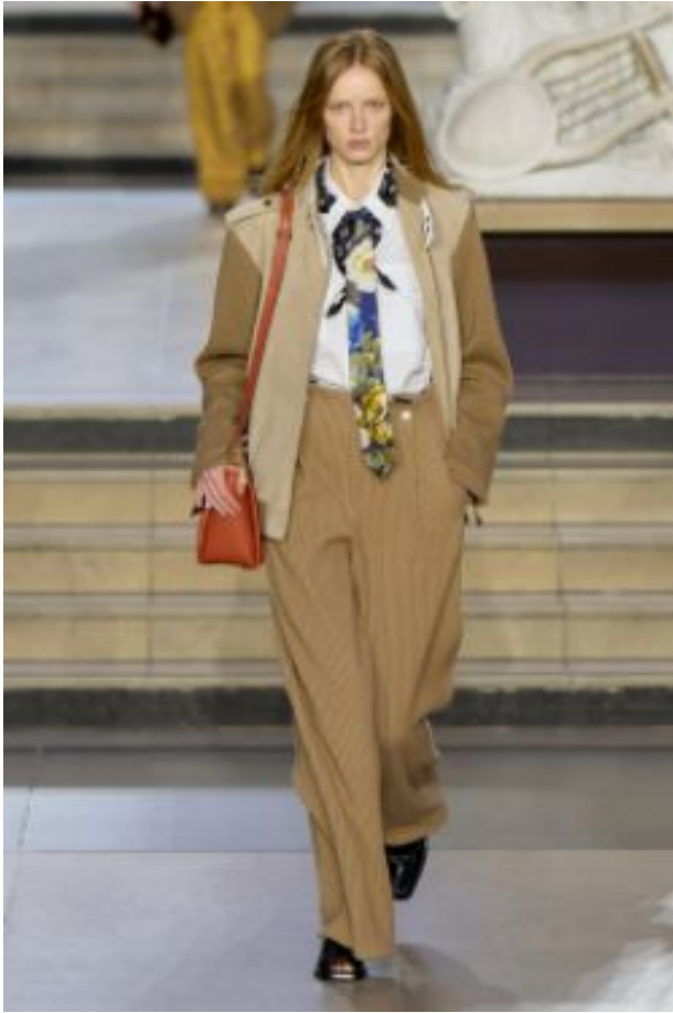
Louis Vuitton 2022 F/W show

The most stylish women have been seen wearing blazers grabbing coffee on a Sunday morning and in the office for a meeting on Monday. The blazer trend is extremely versatile. We can credit our queen Hailey Bieber for leading this trend. Bieber is known for her street style. She is always sporting the most simple but stunning casual fits. We often see her in jeans or slacks, a tee or sweater with an oversized blazer on top.